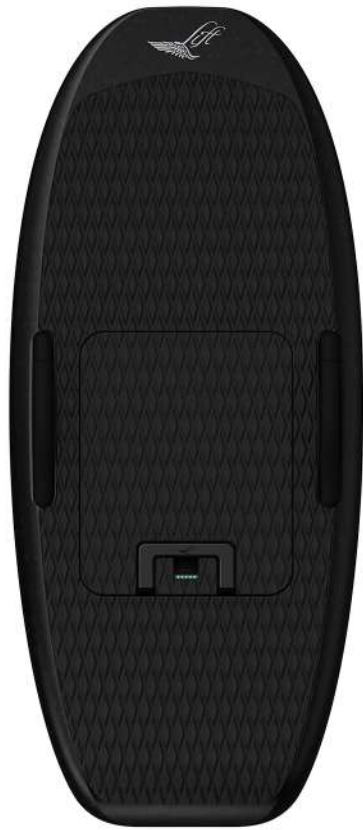
4'4 - Pro