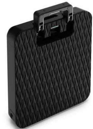
Battery 3200 - 4200€

Light Battery: 60 mins Full Range Battery: 120 mins