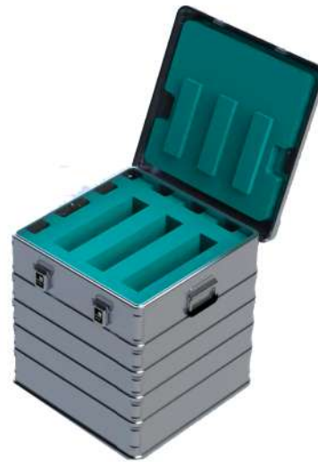
Zarges Fire-proof box 1690 - 2890€

Attachable inflatable to make you efoil ride much easier and stable