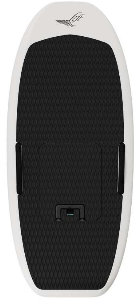
5'4 - Cruiser