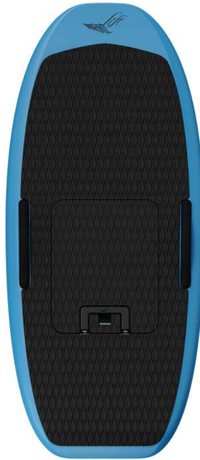
4'9 - Sport